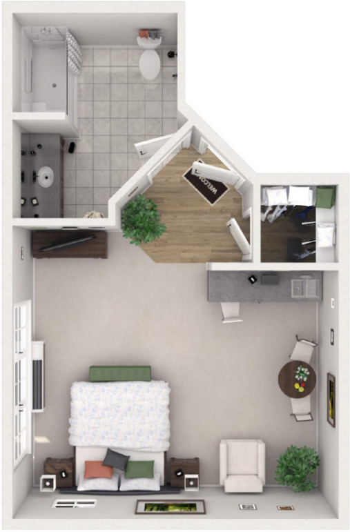
Corner Studio 387 sq. ft.